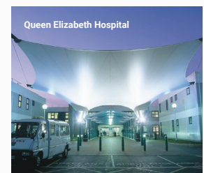
Queen Elizabeth Hospital