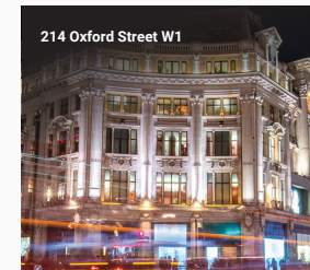
214 Oxford Street W1