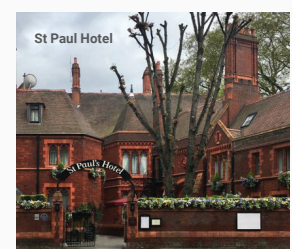
St Paul Hotel